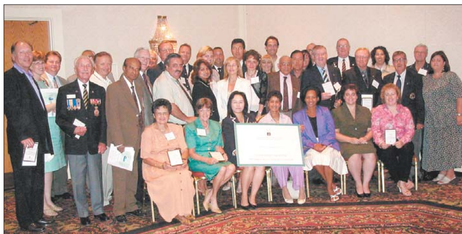
This year, The Credit Valley Hospital Foundation honoured 56 groups in the Roots of Our Community program.